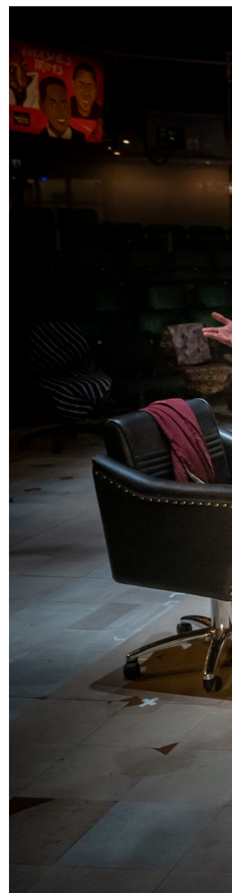
Image 1 - Barbershop Chronicles, Royal Exchange Theatre

Image 2 – A Taste of Honey, Oldham Coliseum