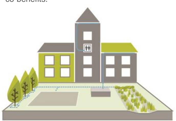
Diagram of an integrated SuDS system

SuDS are a more natural approach to managing drainage in the built environment, helping to hold back and slow down water flow. They support the natural environment to manage water and help to reduce the risk of flooding, as well as delivering wider co-benefits.