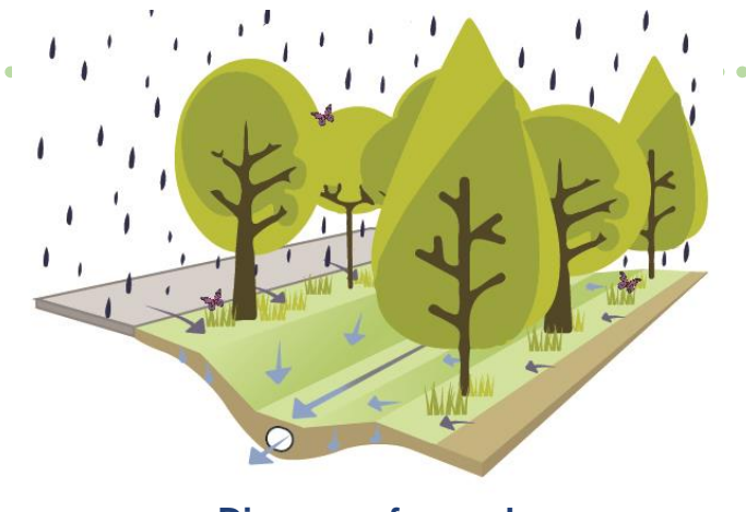
Diagram of a swale

Extreme weather events, such as floods and heatwaves, are an increasingly common part of urban life and are projected to become more frequent and intense as the climate continues to change. Nature-based solutions (NBS) like trees, green spaces and sustainable drainage systems (SuDS) are now being recognised as playing a key role in building resilience to climate change. The real value of NBS comes in the multiple benefits they bring, such as improving air and water quality, increasing biodiversity, capturing carbon and improving public health and wellbeing.