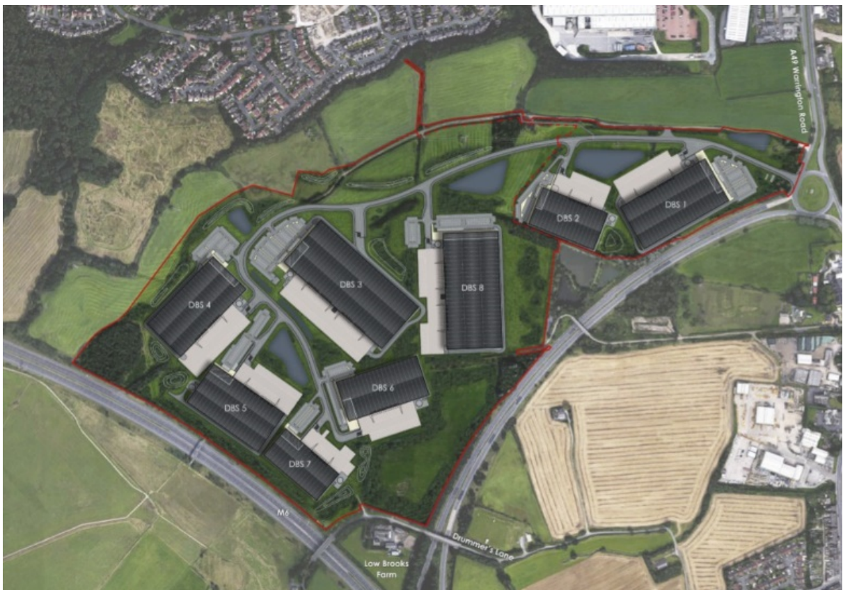
Figure 3a – Illustrative masterplan of Symmetry Park.