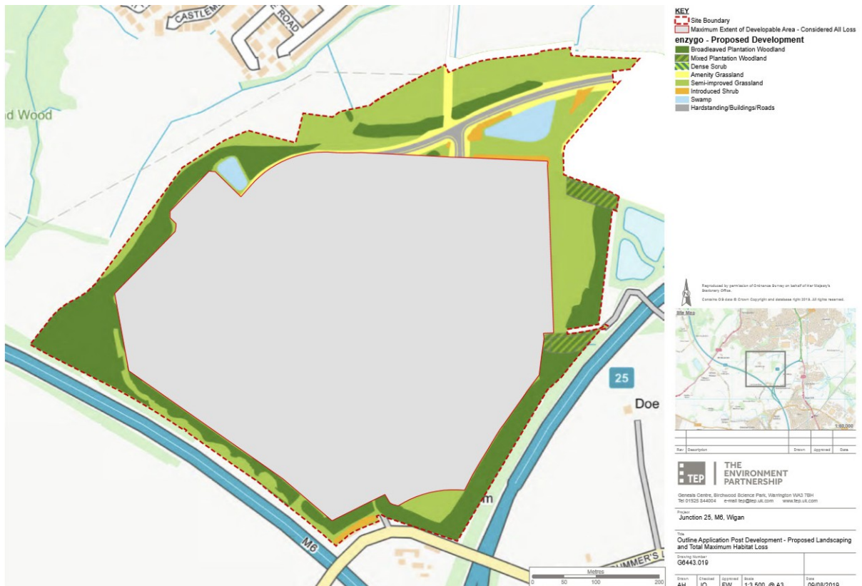
Figure 5 – Plan of assumed habitat losses within the Symmetry Park outline application boundary (grey).

In practice, it is likely that some landscaping elements will be provided for each development platform, so on-site habitat compensation will be greater in the long-term than the calculations of on-site losses would indicate. Figure 6 provides an example of the landscaping that could occur within the development, but this was not used to inform the calculation of the gains on site.