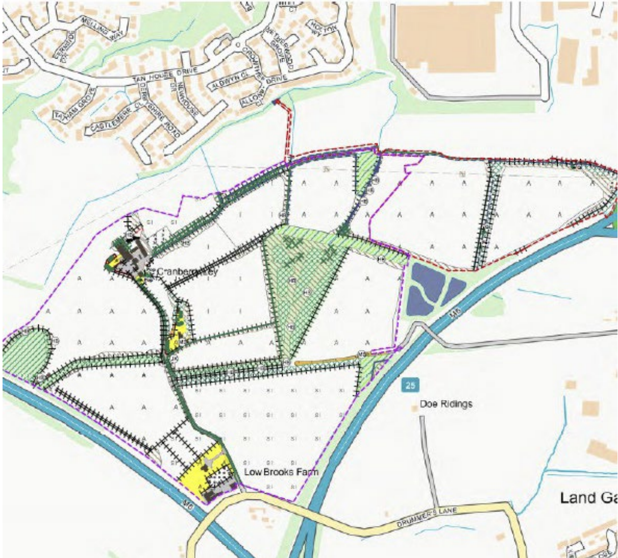
Figure 4 – Phase 1 habitat survey of the Symmetry Park site.