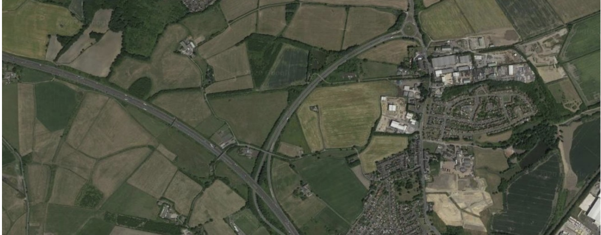
Figure 2 – Ariel view of the Symmetry Park application site.

The site is currently greenfield, with a mixture of agricultural land uses (mostly silage grassland), some residential properties and some semi-natural habitats (plantation woodland, closed scrub, hedges, ditches and semi-improved grassland). Up until the 1980s the land was used for coal mining and ancillary activities (Figure 2).