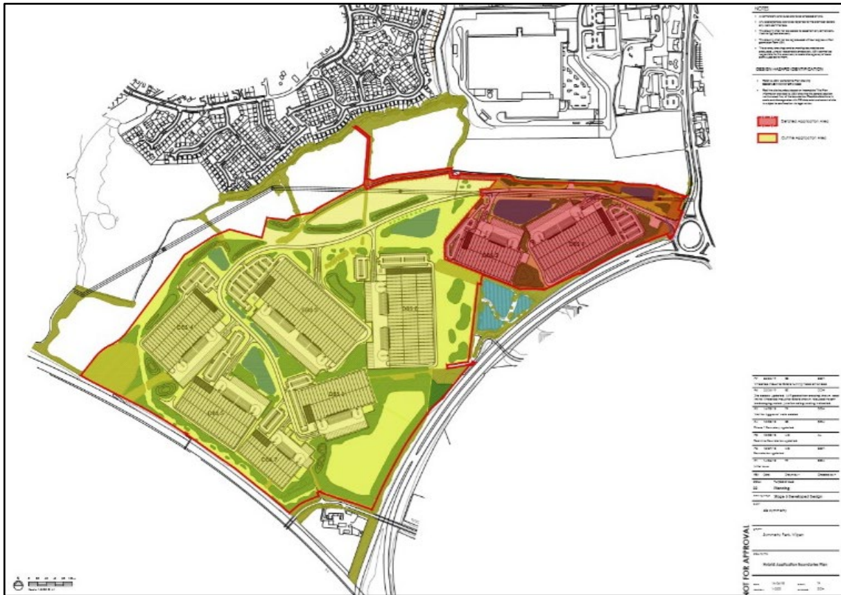
Figure 3b – Detailed application boundary (red) and outline application boundary (green) for Symmetry Park.

Development of the site requires the demolition of existing buildings and reprofiling. This reprofiling comprises of: