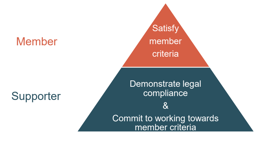
Figure 1: the two steps to charter membership.

Therefore, even though the focus of the charter would be on exceeding legal minimum requirements, becoming a charter member would also involve demonstrating minimum legal compliance.